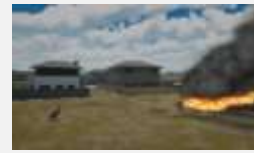
Suburban & Rural Interface